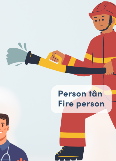
Person tân Fire person