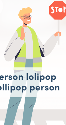
Person lolipop Lollipop person