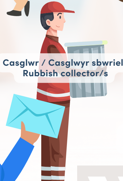
Casglwr / Casglwyr sbwriel Rubbish collector/s