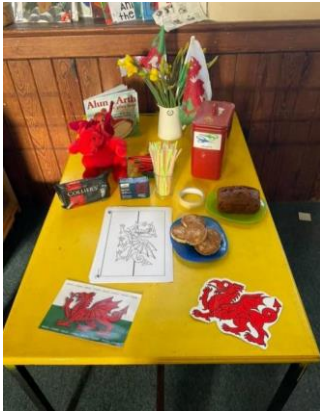
Picture 1: Welsh Celebrations: St David's Day, Owain Glyndwr Day, Shwmae day. Urdd and Jac y do/Sali Mali. Picture 2: Our Bilingual communication board for children to express and communicate their needs.